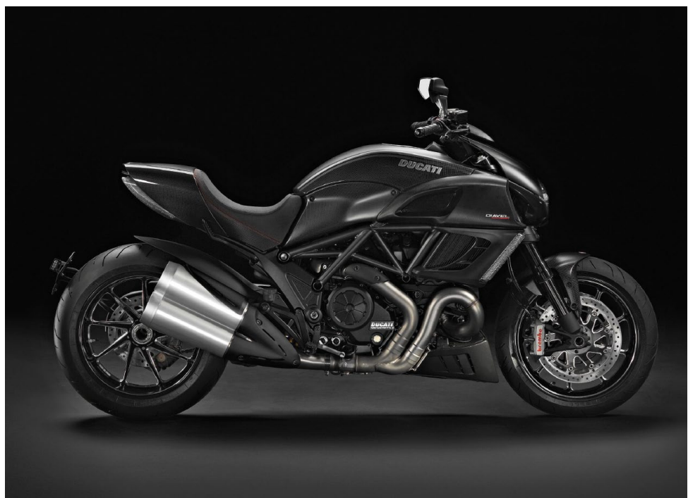
Ducati is a prestigious brand with a strong identity and supported by a wide community of passionate fans.

Of the 1,000 employees who work at Ducati, nearly 200 are involved in research and development (R&D), an area the company supports with large investments every year. The engineering staff includes