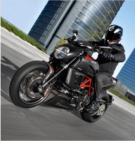
The visualization capabilities of NX will soon replace photography in Ducati's motorbike manuals.