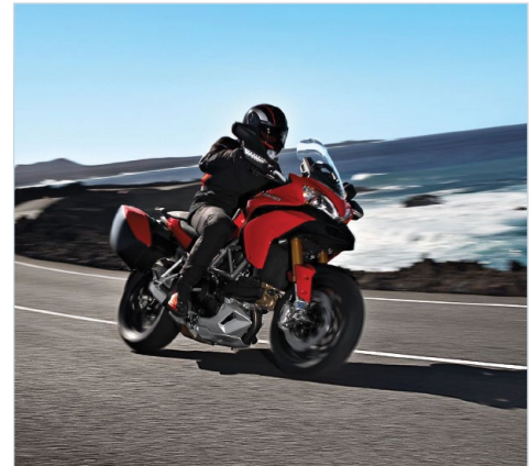
Over the past decade, motorbikes have incorporated more electronics and software, bringing product configuration handling requirements similar to those of the auto industry.

In spite of greater product complexity, Ducati has cut one year off the development cycle for new motorbikes. "Our design and development cycle has been reduced from an average 36 to 40 months to just 24 months, mainly thanks to the tools provided by Siemens PLM Software," says Giusti. "We are also able to update all existing models at annual intervals. It would be unthinkable to achieve such results using conventional design methods."